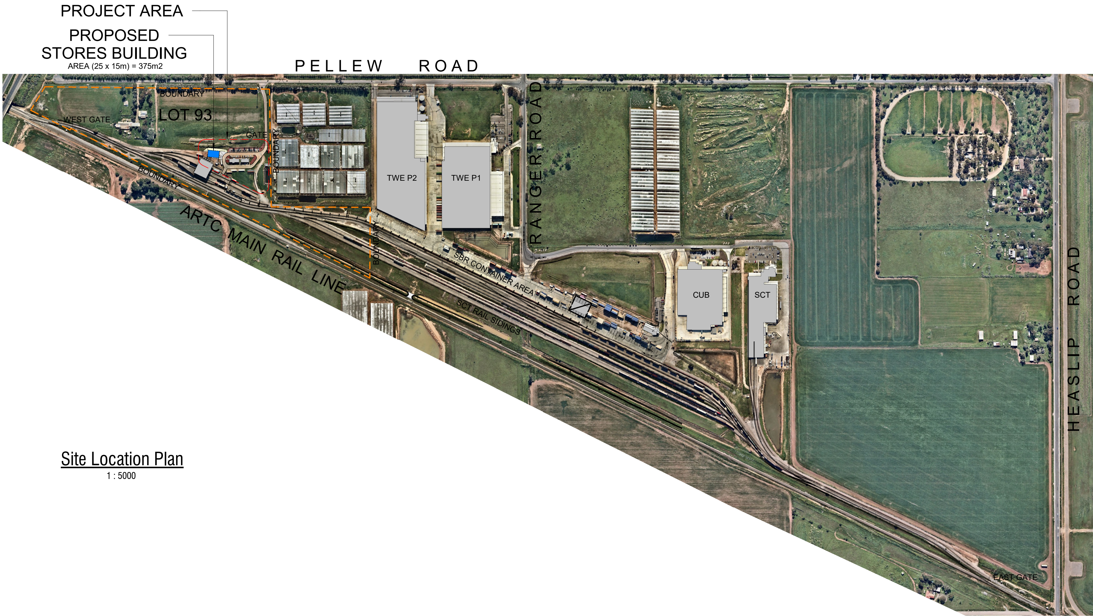
Site Location Plan 1 : 5000